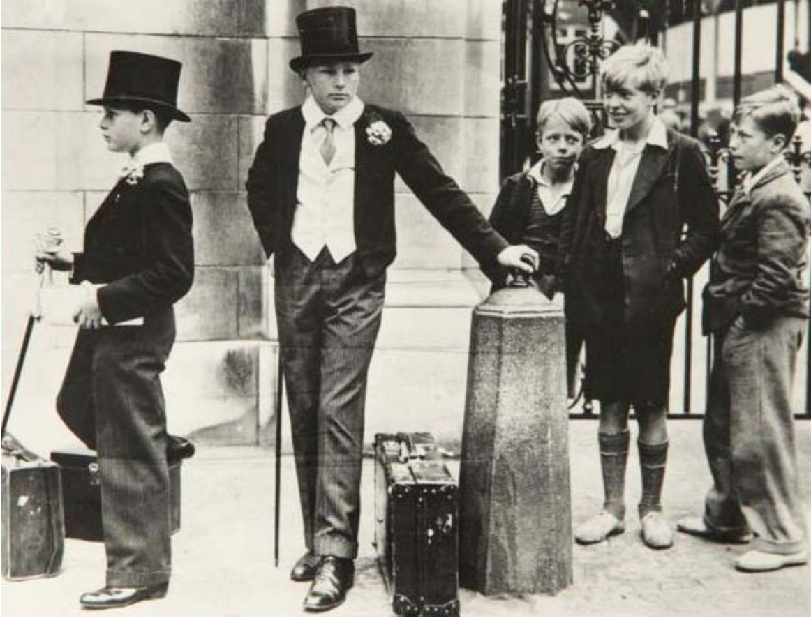
Jimmy SIME, untitled , 1937 (the photograph was taken in England).