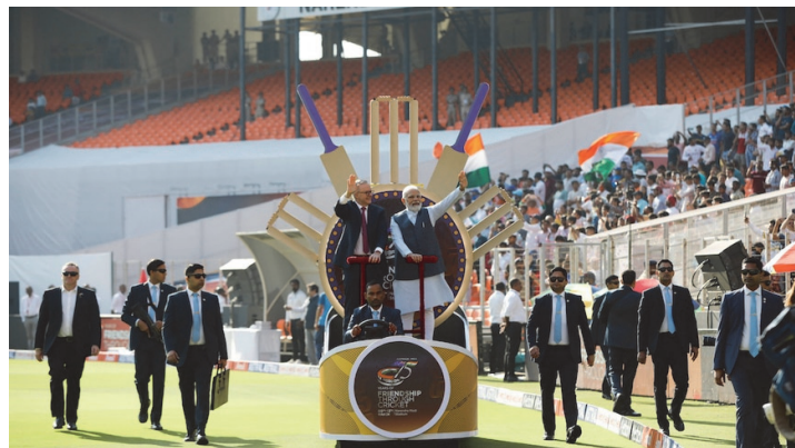
Indian Prime Minister Narendra Modi and Australia Prime Minister Anthony Albanese were taken on a chariot ride around the cricket pitch.

15 But perhaps the best showcase remains cricket – a game loved in both India and Australia. In a nation where the sport is inextricably linked to politics, there's no better place to cement ties between the countries than on the first day of the fourth Test. The event has been tightly controlled, [...] drawing criticism that it's being managed to present a glorified view of the Indian government. [...]