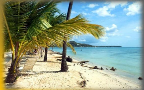
Plaza de arena negra y ..... blanca