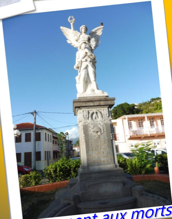
Monument aux morts