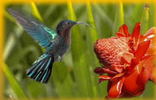
Isla de las flores