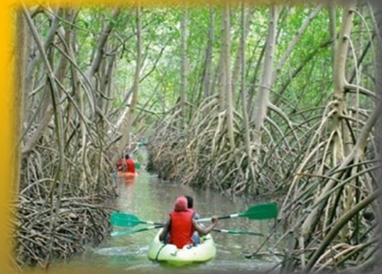
Charcos para descubrir la biodiversidad