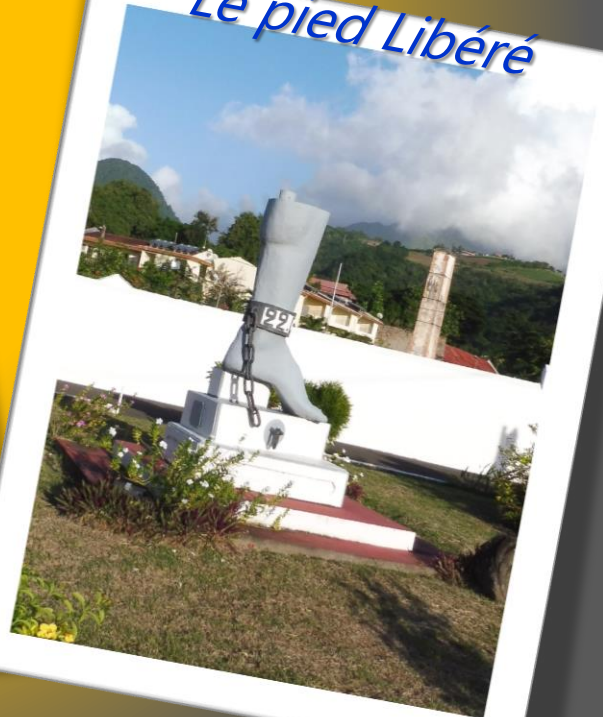
Le pied Libéré