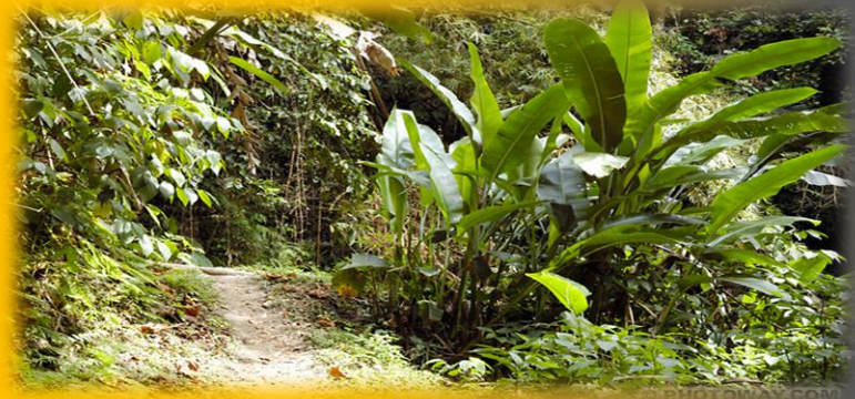
Selva tropical y jardines