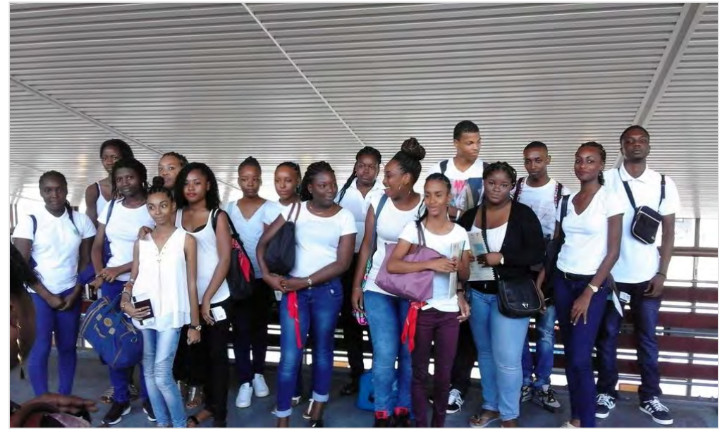
The SJPP, Frantz Fanon High School teachers and the students together

We enjoyed sharing these moments together.