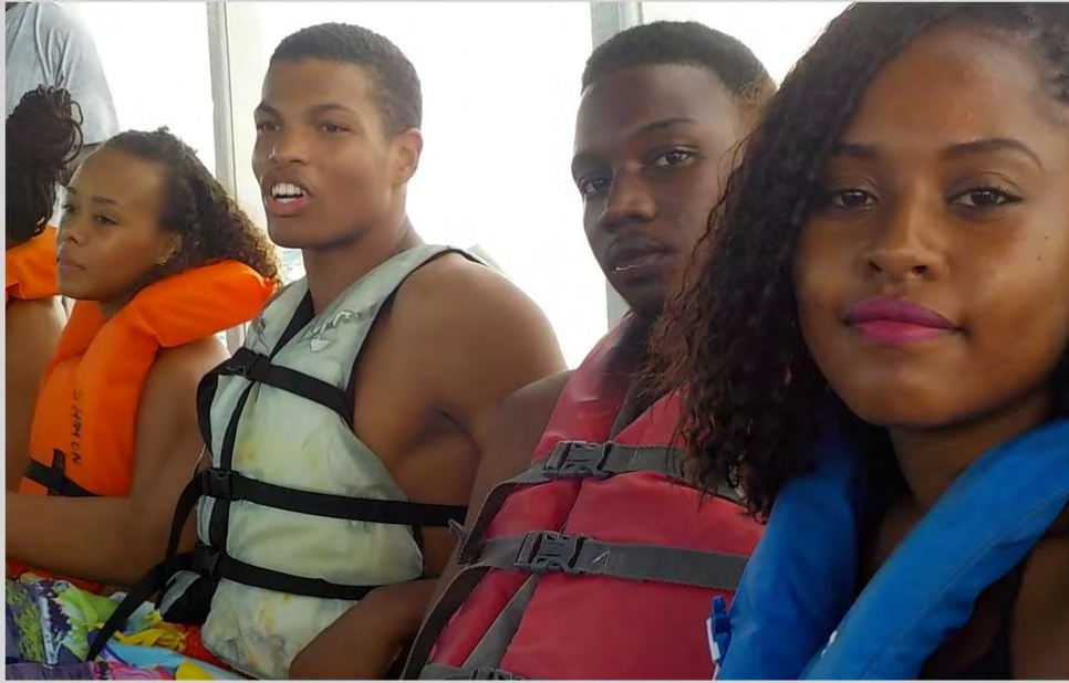
The TST2S2 students from Frantz Fanon high school